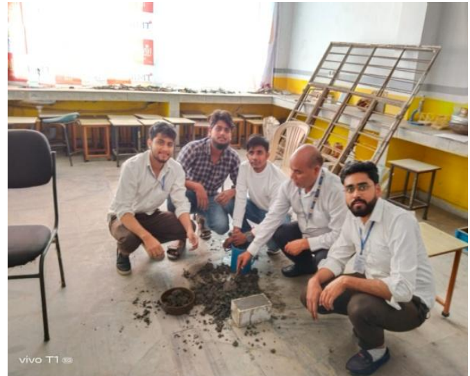
Papercrete Brick Specimen Making in Progress