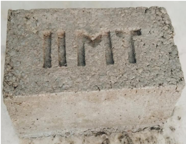
Specimen of Papercrete Brick

This research was conducted by IIMT College(Gr.Noida Campus) students of Department of Civil Engineering.